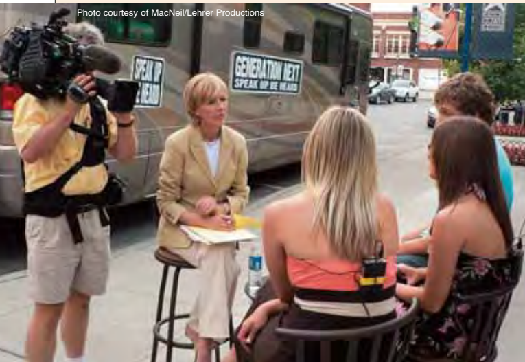
Judy Woodruff tours the nation with the Generation Next production team.

"This generation is 17 percent Hispanic, 14 percent African American, and 4 percent Asian. One in every five is the child of an immigrant. One in every 10 is the child of a parent who is not an American citizen," she notes. "I want decision makers and the American people to see that this generation is coming along at a time of enormous change in our country and in the world. We are giving them a complicated world to grow up in, with global warming, economic globalization, exploding technology, and war. We need to hear their views," explains Woodruff. "Every generation thinks they have something to say, but I think there's something really special about this generation and the times in which they're living."